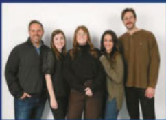
Vigil Project Band