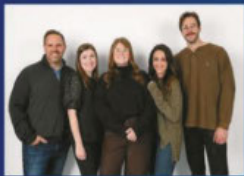
Vigil Project Band